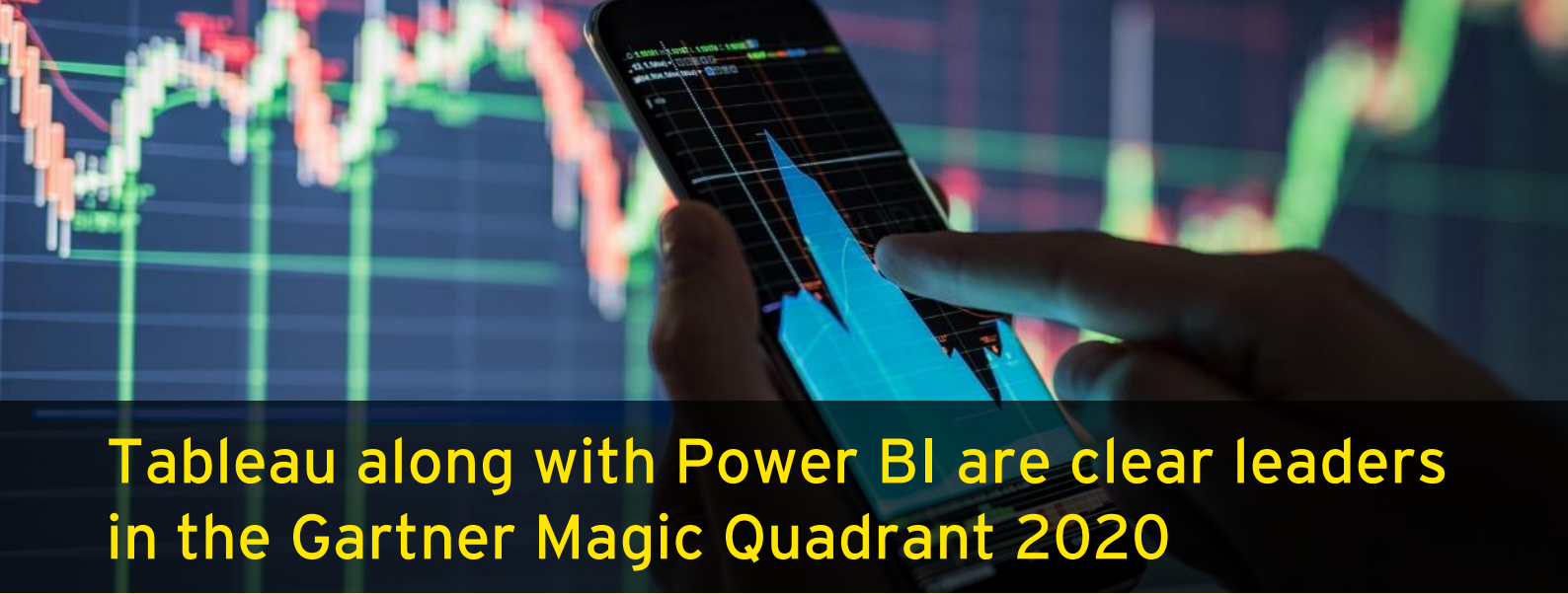
Tableau along with Power BI are clear leaders in the Gartner Magic Quadrant 2020