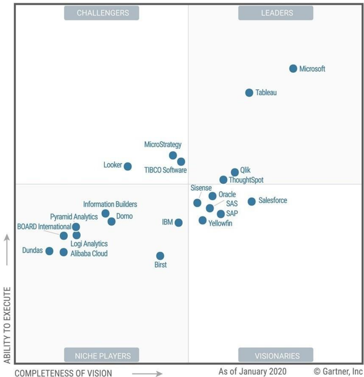
Figure 1. Magic Quadrant for Analytics and Business Intelligence Platforms